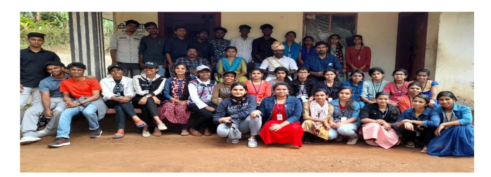
HISTOINTERFACE: Visit to Tribal Settlement at Kozhimala