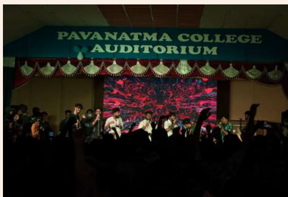
College Day Musical Concert