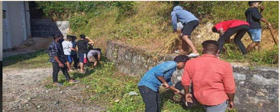
SEVEN DAY CAMP UNARVU 2021