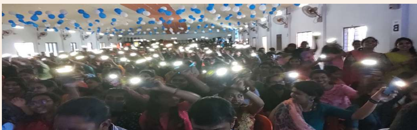
College Day Celebration