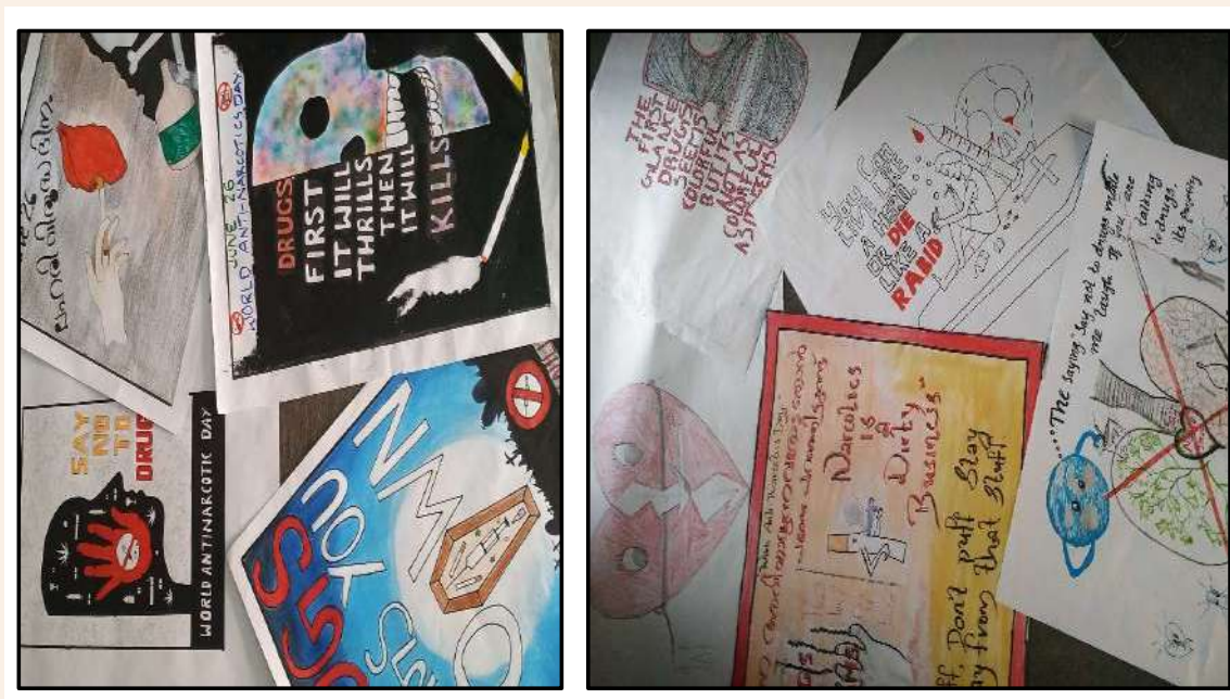
E-Poster Designing Competition

Anti- Narcotic Club aims at working against the use of alcohol and drugs. On commemorating the world Anti-Drug Day on June 26, 2021, the Club conducted an e- poster designing competition for the students and awareness programme for parents.