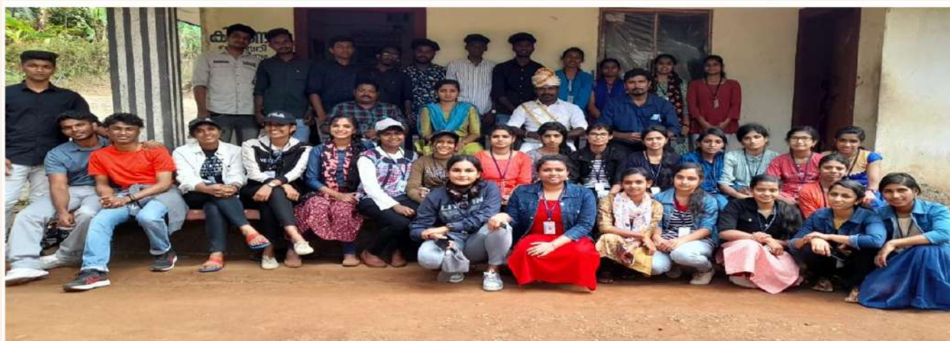
HISTOINTERFACE: Visit to Tribal Settlement at Kozhimala