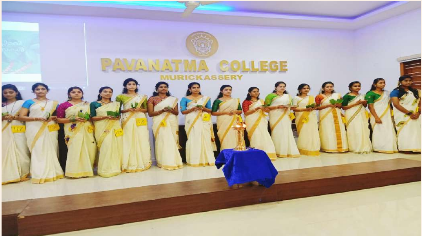
Kerala Piravi-Malayalimanka Competition