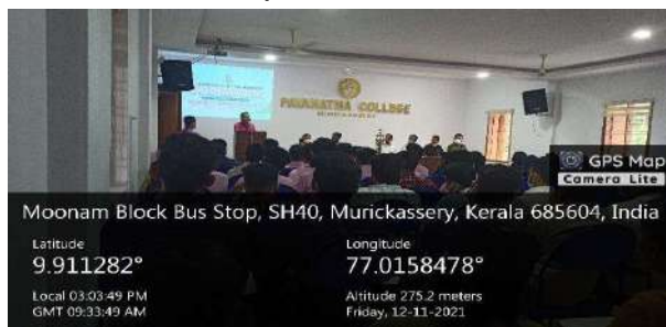
LEGAL AWARENESS CLASS