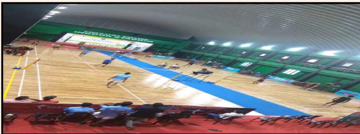
Pavanatma Indoor Stadium: MGU south Zone Badminton Championship