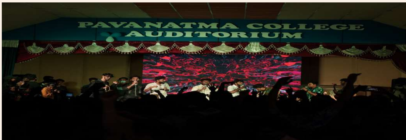
College Day Celebration-Almaram Music Band