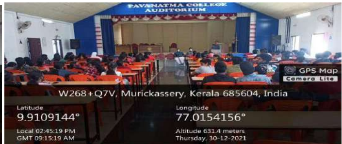
SEMINAR- DIASTER MANAGEMENT AND HOME RADIO