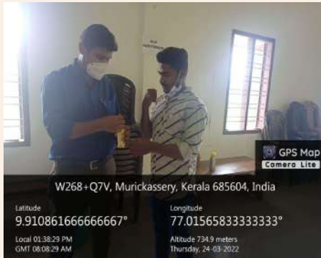
Blood Donation Camp 24-03-2022