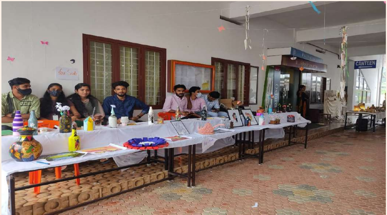
Exhibition: ENTREPRENEURSHIP DEVELOPMENT CELL