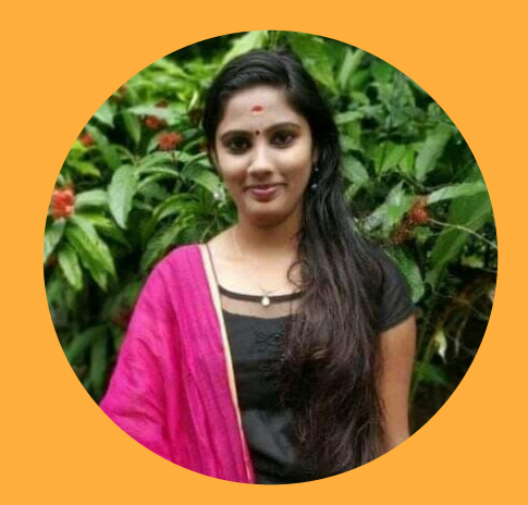
POST CHECKING (MILMA, KATTAPANA)